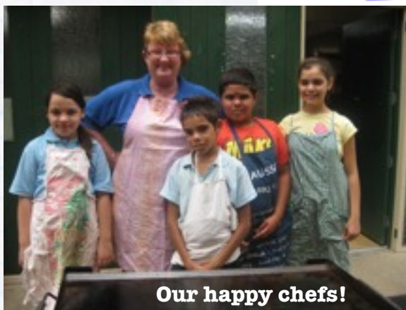
Our happy chefs!