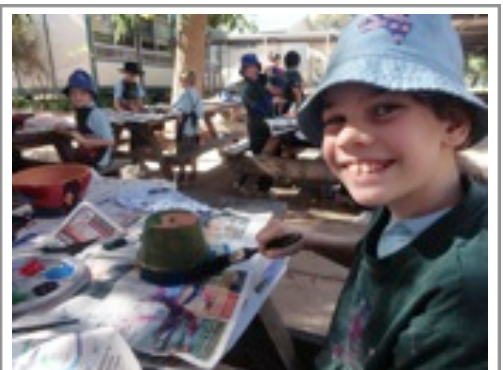
Bunnings Day: painting pots