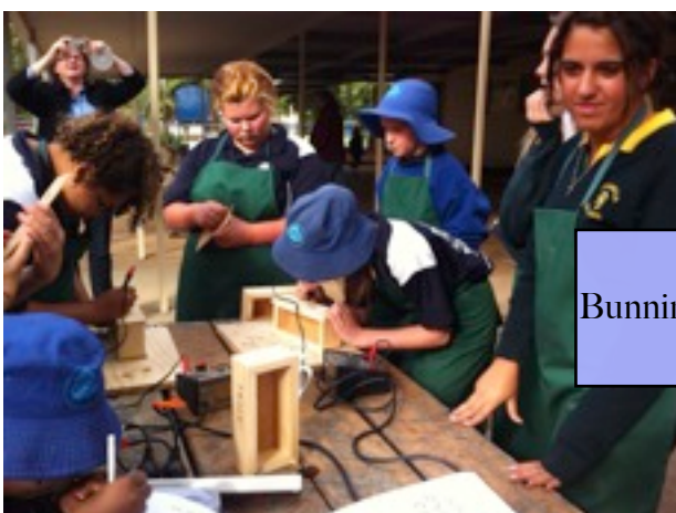
Bunnings visit at school