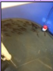
Aquaponics: Fingerlings in the aquaponics shed.

On a sad note, someone in the community has damaged the chook pen over the weekend and let the chooks out. Luckily, as there are every weekend, staff members were in the school and found them before night time when a fox would almost certainly have killed our chooks. I am very disappointed by this and I am warning now, as I did when we got the chooks, that if this were to happen again, the chooks will be taken out of the school for good. If you have any information about who is damaging our chook pen, endangering our chooks and also not showing respect for other equipment in the school, please let us know and the information will be passed on to the police.