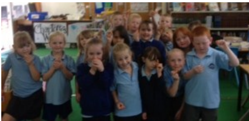
K/1 eating the carrots that they have grown themselves