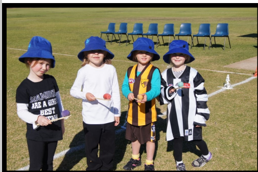
Egg and Spoon race at the Buronga Athletics carnival on Friday 21st June.