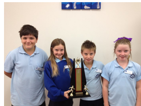
Winning Swimming House— Magpies