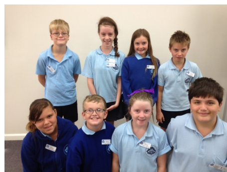
Sport Captains and Vice Captains