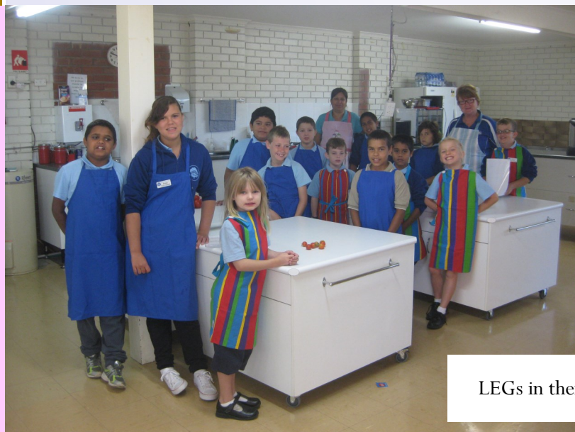
LEGs in their new aprons