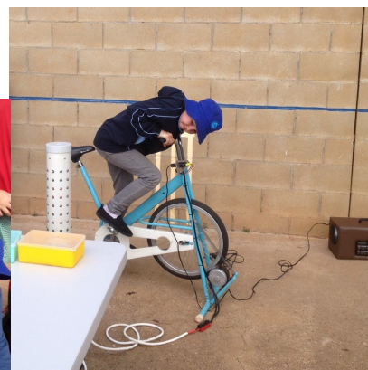
Environmental Ed Excursion