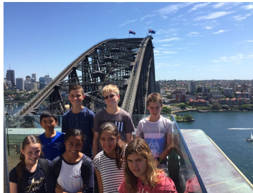
Pylon Climb with the Narraweena Captains