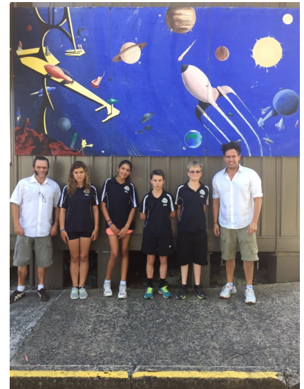
With the Narraweena Yr 6 teachers