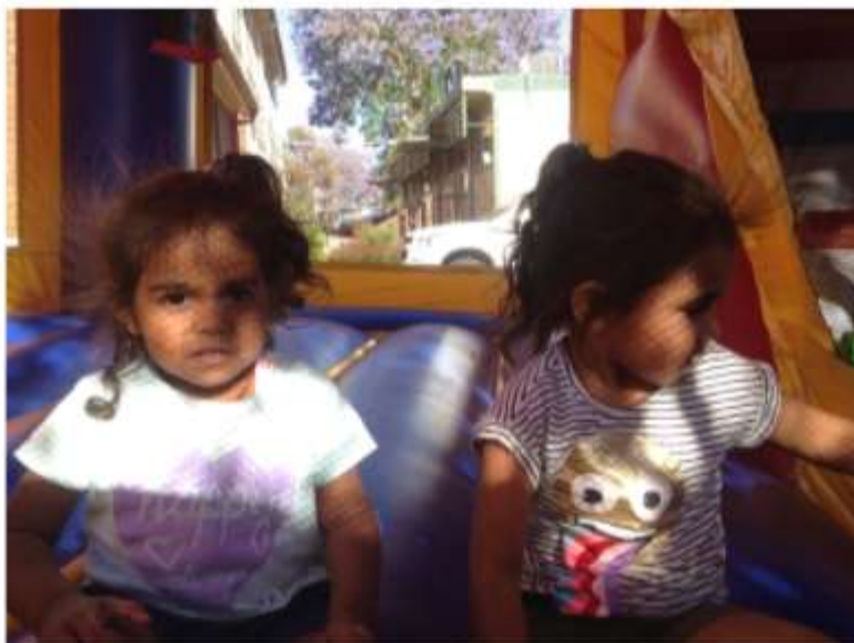
Food, fun and entertainment at the Buronga Public School Food Festival